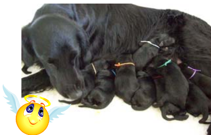
Isabel Leonhardt plus 10!